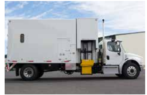
2017 NON-CDL Freightliner M2 Shredfast SF300 Refurb