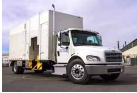
2016 Freightliner M2 Shredfast SF300 Refurb