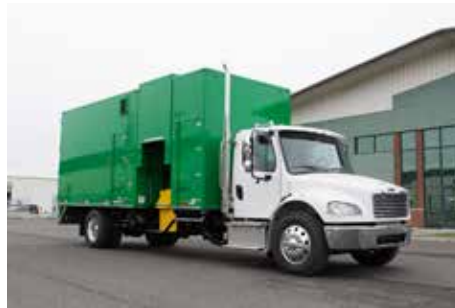
2018 Freightliner M2 Shredfast SF300 Refurb