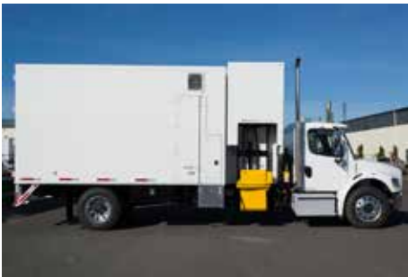
2017 Freightliner M2 Shredfast SF300 Refurb