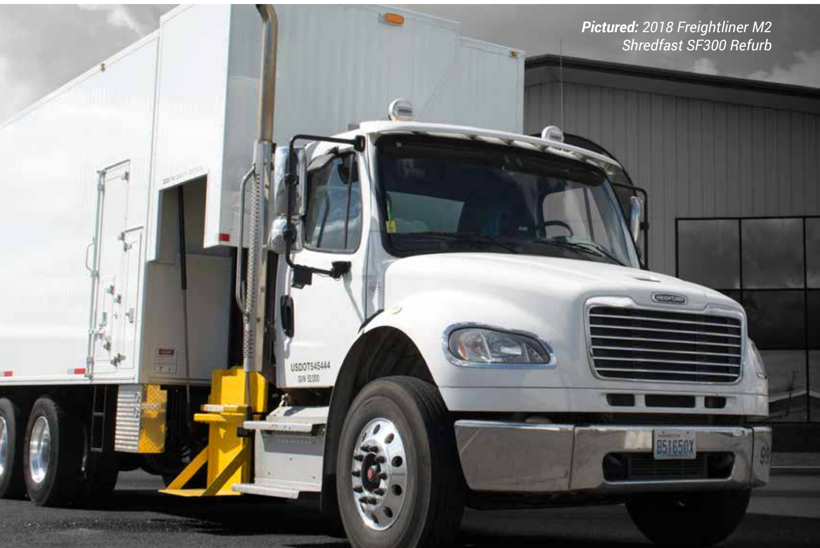
Pictured: 2018 Freightliner M2 Shredfast SF300 Refurb

ShredSupply Inc. 2714 S Garfield Rd. Airway Heights, WA 99001