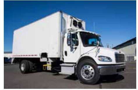
2017 Freightliner M2 Shred-Tech MDS-25GT Refurb