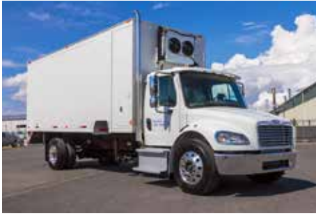
2016 Freightliner M2 Shred-Tech MDS-25GT Refurb