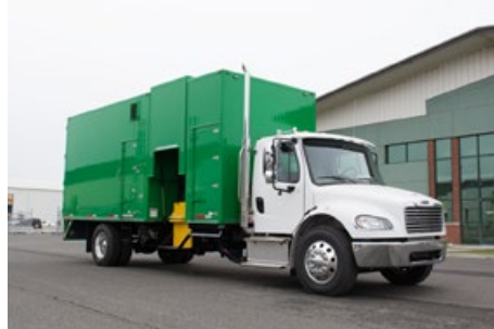
2018 Freightliner M2 Shredfast SF300 Refurb