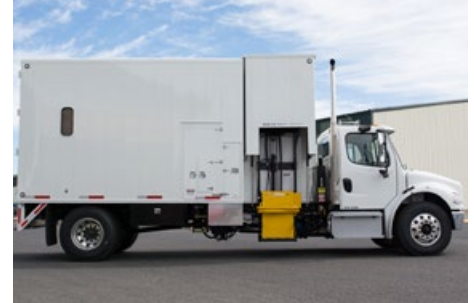
2017 NON-CDL Freightliner M2 Shredfast SF300 Refurb