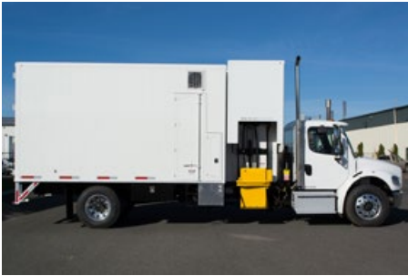
2017 Freightliner M2 Shredfast SF300 Refurb