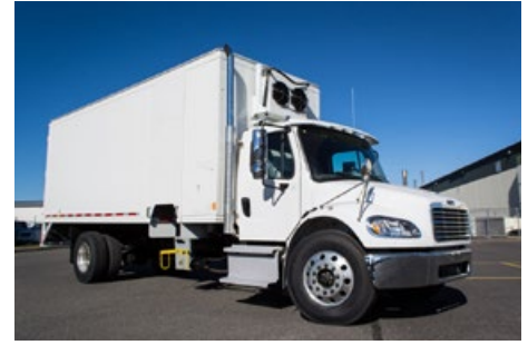
2017 Freightliner M2 Shred-Tech MDS-25GT Refurb