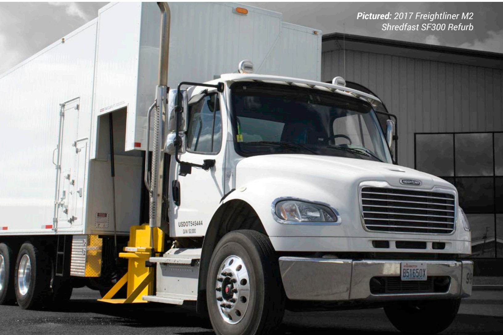
Pictured: 2017 Freightliner M2 Shredfast SF300 Refurb

ShredSupply Inc. 13026 W McFarlane Rd. Bldg C2 Airway Heights, WA 99001