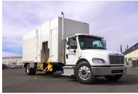
2016 Freightliner M2 Shredfast SF300 Refurb