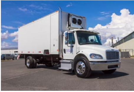
2016 Freightliner M2 Shred-Tech MDS-25GT Refurb