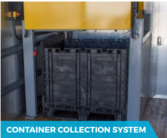
CONTAINER COLLECTION SYSTEM