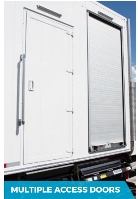
MULTIPLE ACCESS DOORS