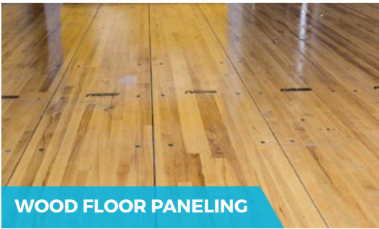
WOOD FLOOR PANELING